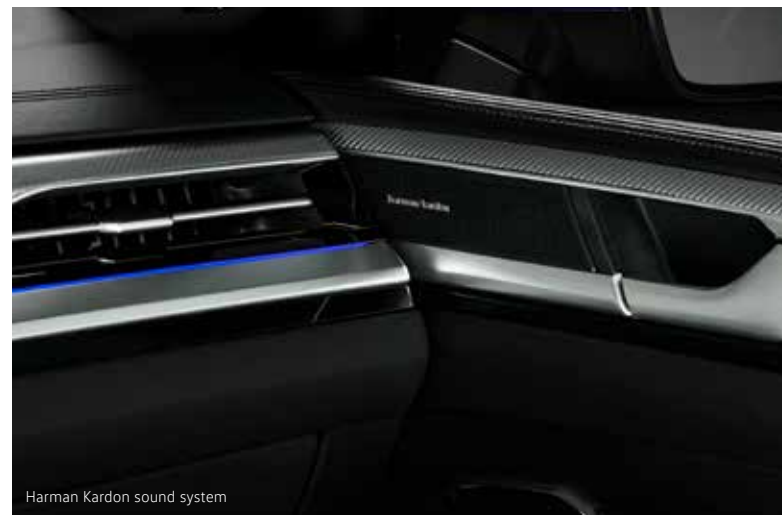
Harman Kardon sound system

The Arteon R-Line 4MOTION comes equipped with a premium 700W Harman Kardon sound system with 12 high-performance speakers including a subwoofer, delivering astounding acoustics.