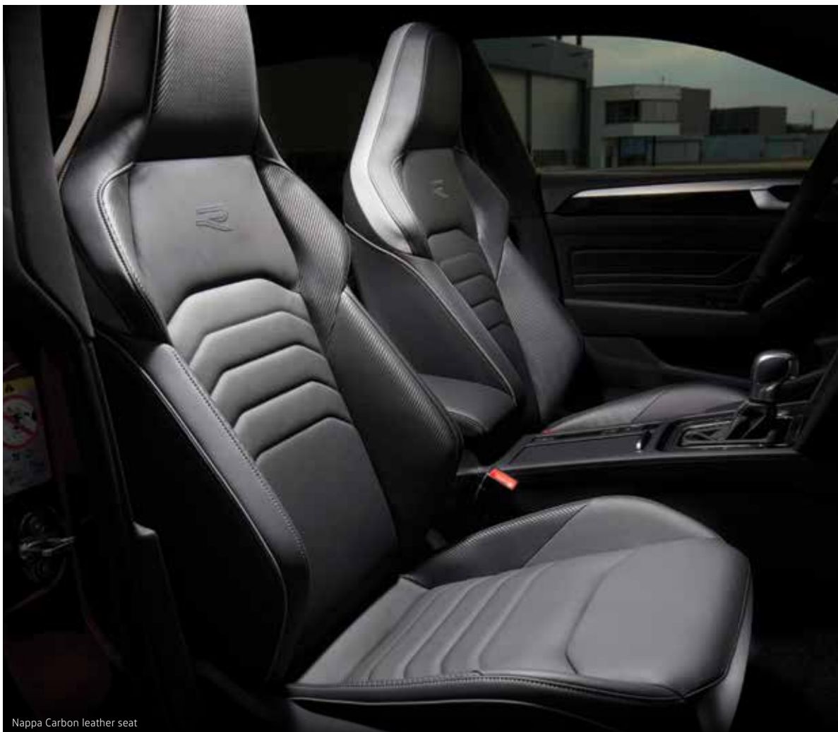
Nappa Carbon leather seat

Beautifully sculpted to offer supreme support and comfort, the ergoComfort Nappa Carbon leather sport seats come with an electric 14-way adjustment for seat height, seat length, seat cushion angle, and backrest angle. For your convenience, the Area View camera also offers a 360° view of your surroundings whether in parking, turning or leaving a driveway.