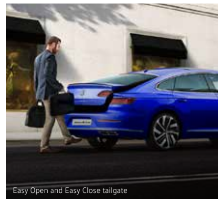
Easy Open and Easy Close tailgate