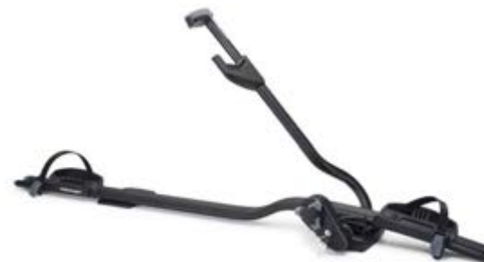
Bicycle holder for the vehicle roof