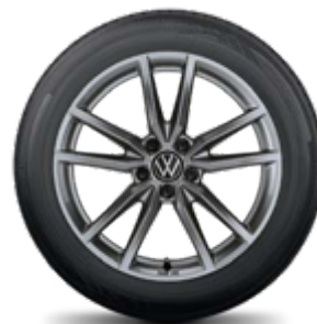
"Pretoria", 18-inch Grey Metallic