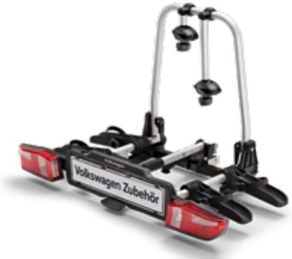
Bicycle carriers for the towing bracket