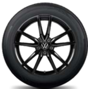
"Pretoria", 18-inch High-gloss Black