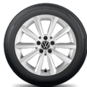
"Merano", 16-inch Brilliant Silver