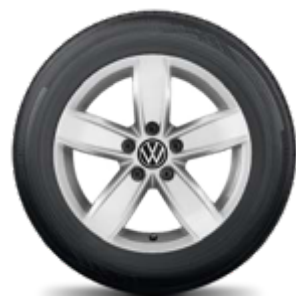
"Corvara", 15-inch Brilliant Silver