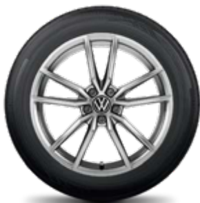
"Pretoria", 18-inch Sterling Silver