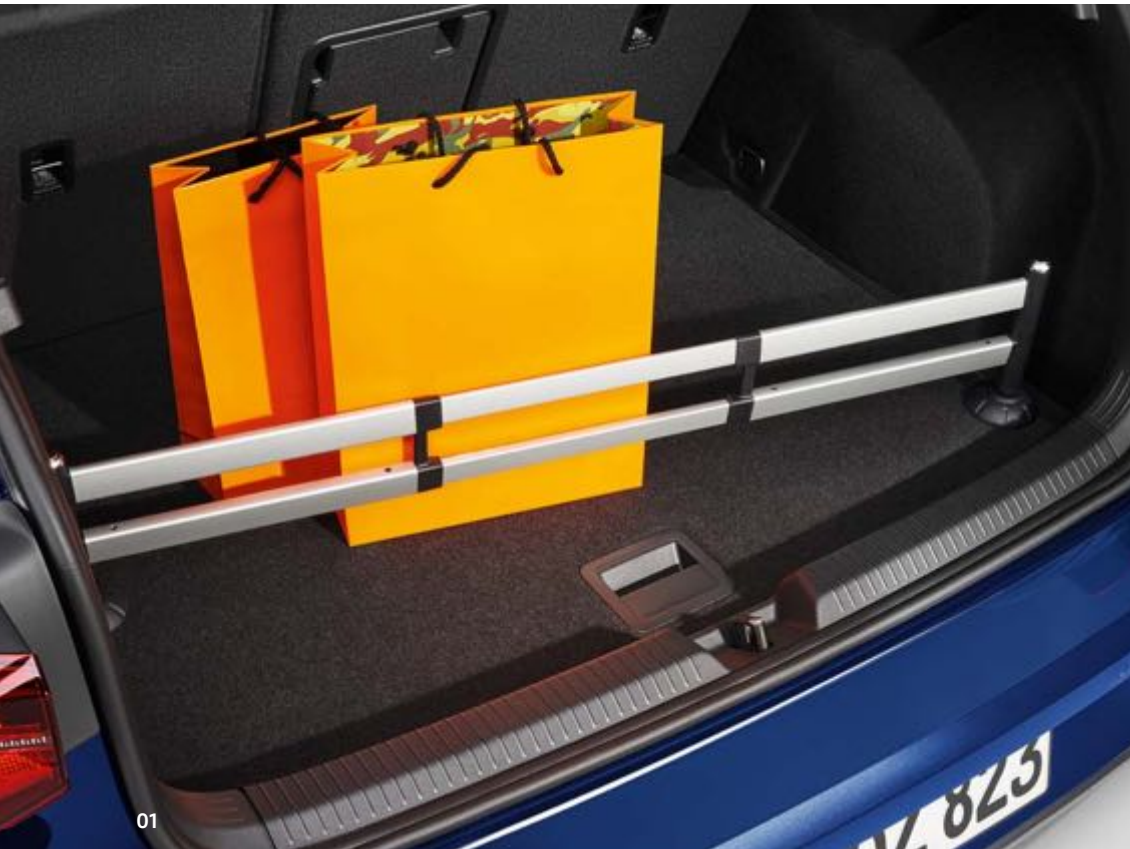
01-02 The Volkswagen Genuine luggage compartment plug-in module 1 (01) lets you flexibly partition your vehicle's luggage compartment, preventing objects from sliding around. Small and mid-sized objects remain fixed in their place, thanks to the tearresistant Volkswagen Genuine luggage net 1 (02).