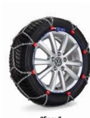
"Snax" 15, 16, 17 inches

The requirements of the current ABE (German type approval) or current certification must be complied with. Please use the standard-fit wheel bolts provided. Please ensure that the load index (LI) of the selected tyres is not lower than the LI specified in the vehicle documents or CoC papers. All winter alloy wheels are treated with a special ultra-resistant coating to ensure that they are suitable for use in winter.