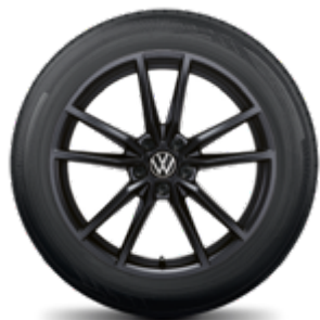
"Pretoria", 18-inch Dark Graphite Matt