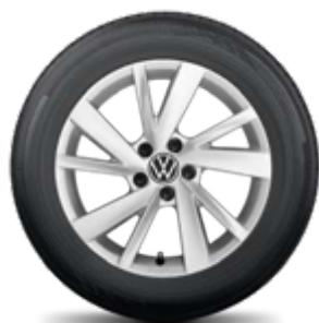
"Gavia", 15 / 16 / 17-inch Brilliant Silver