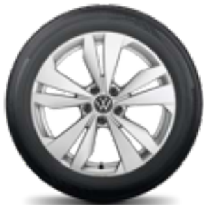
"Loen", 18, 19-inch Brilliant Silver