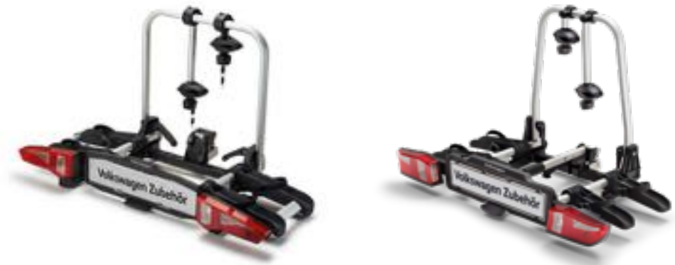
Bicycle carriers for the towing bracket

The standardised factory-fitted FIX4BIKE connection can be used to attach your Volkswagen bicycle carrier to the towing bracket. This does not increase the payload.