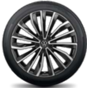
"Seoul", 20-inch Dark Graphite Metallic, diamond-turned

Further accessories for your wheels, including valve caps, wheel bolt locking sets, tyre bag sets and snow chains, can be found in the universal accessories section on page 52.