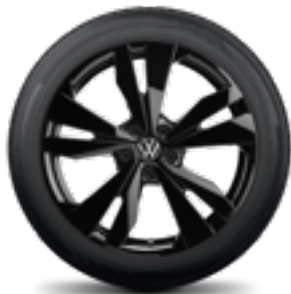
"Loen" 19-inch Black, gloss