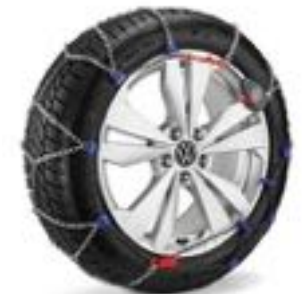
"Servo 9" 18, 19-inch

The requirements of the current ABE (German type approval) or current certification must be complied with. Please use the standard-fit wheel bolts provided. Please ensure that the load index (LI) of the selected tyres is not lower than the LI specified in the vehicle documents or CoC papers. All winter alloy wheels are treated with a special ultra-resistant coating to ensure that they are suitable for use in winter.