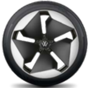
"Sanya", 20-inch Black, diamond-turned