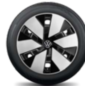
"Bicolour design", 18-inch